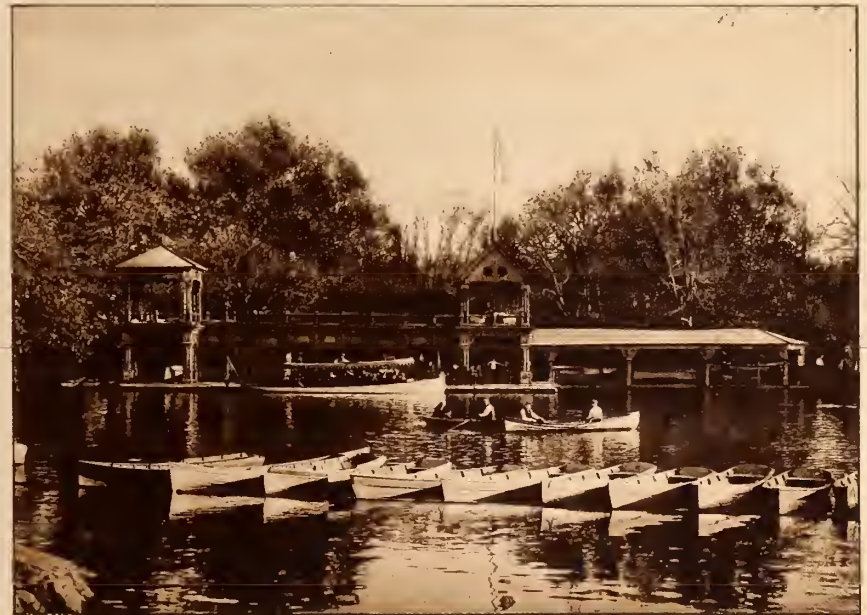
BOAT HOUSE IN CENTRAL PARK.